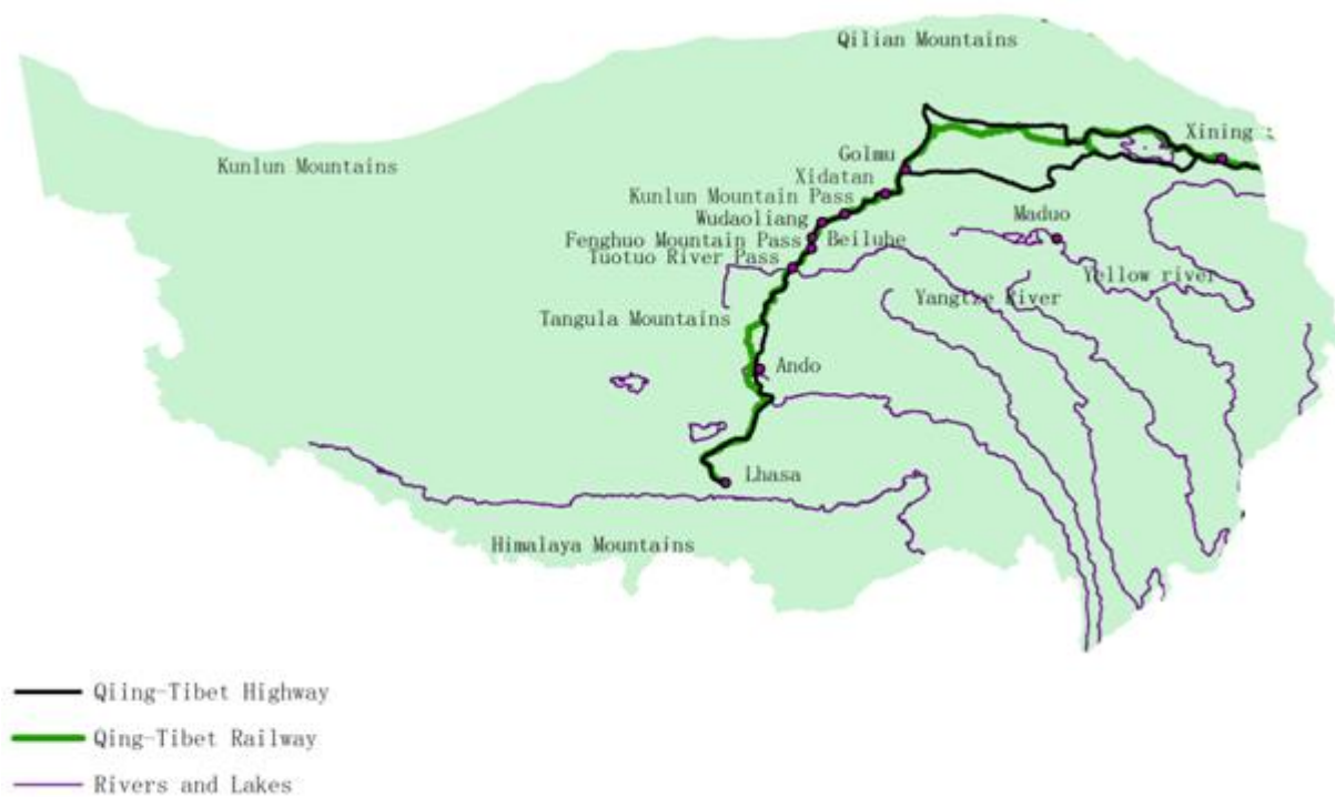
Figure 2. Location of main permafrost observation stations on the TP

Based on it, Li et al. [25] further evaluated the integrated effect of latitude and altitude on permafrost distribution on the TP. Global warming has led to a rise of 40-80 m in the lower-altitude limit of permafrost on the TP since 1970s [14]. Cheng and Wu [13] further showed that the lower-altitude limit of the permafrost has moved up by 25 m in the north during the last 30 years and between 50-80 m in the south over the last 20 years. In addition, Fukui et al. [26] investigated changes in the lower limit of permafrost in the Khumbu Himal of the Nepal Himalayas, which is located in the south-west TP. In 1973 the permafrost lower limit was estimated to be 5200–5300 m above sea level on the southern slopes in this region while it was 5400–5500 m in 2004. So the permafrost lower limit has risen 100–300 m in the Khumbu Himal of the Nepal Himalayas during 1973-2004.